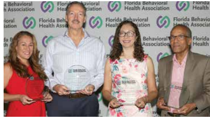
2019 Awards of Excellence Recipients